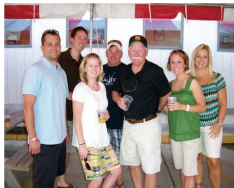
Relaxing down the shore with family & friends at the shore reunion.