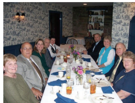
Lunch was served to members of the Class of 1953 & 1958 on Founder's Day at the Mainland Inn.

For October 2009, the classes of 1954, 1959 and 1984 will be invited. Look for your invitation in the mail over the summer.